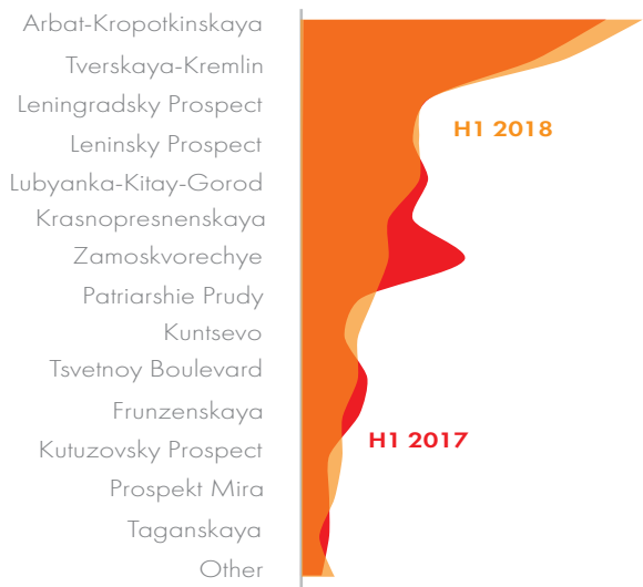
Analysis of the most popular areas for living in Moscow in terms of supply